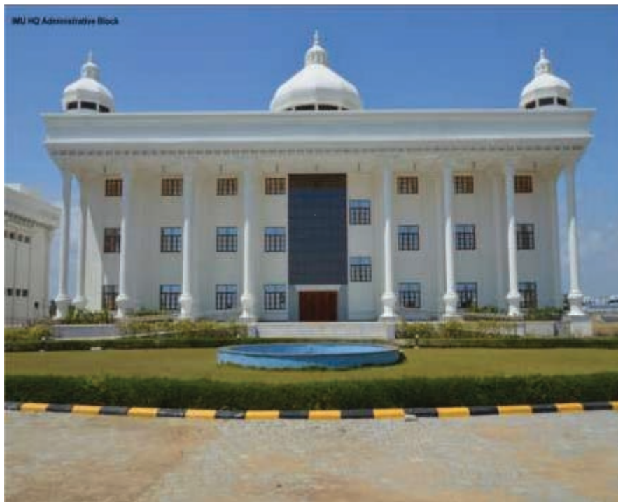
Administrative Block, Library and Auditorium Block