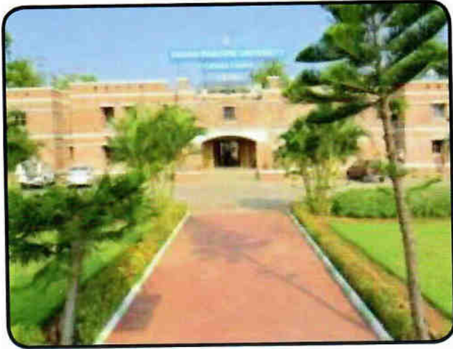
IMU Premises – View I