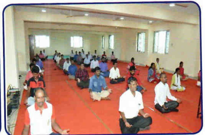
International Day of Yoga in Progress at IMU-HQ