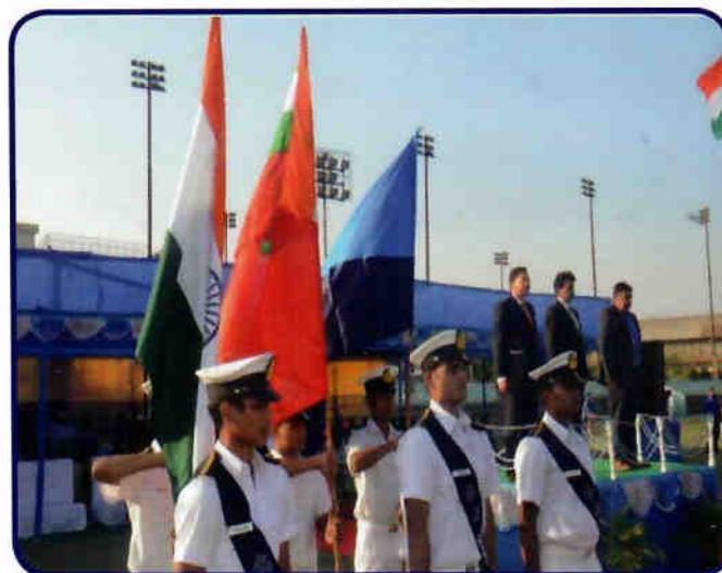
Pre-Passing Out Parade - Nov 2018