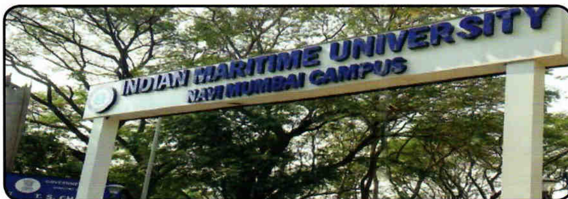
IMU Premises – View III