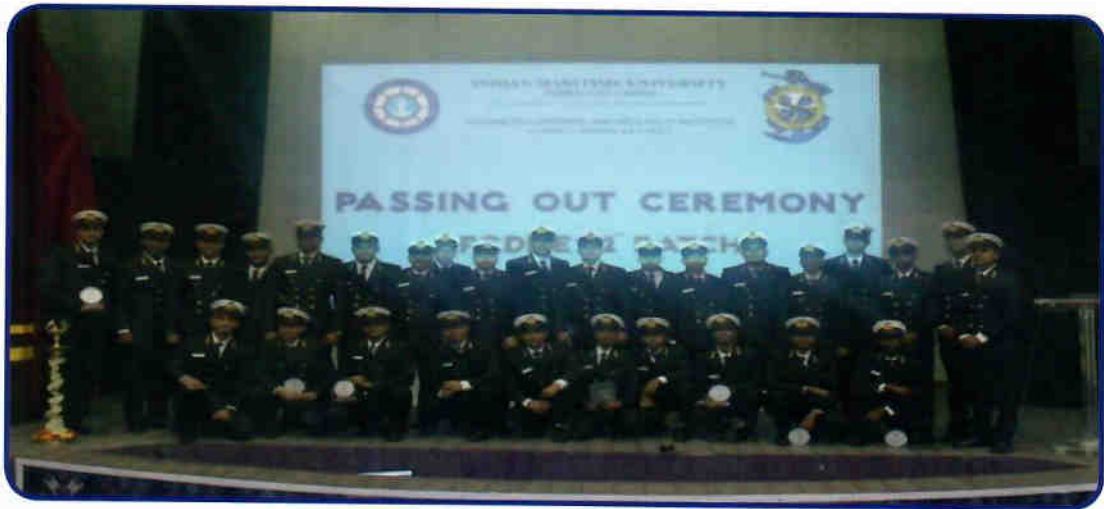
Passing Out Ceremony