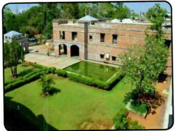
IMU Premises – View IV