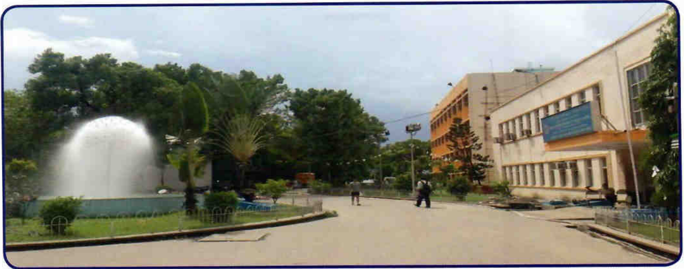
Academic-cum-Administrative Block - Front View