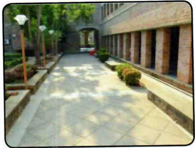
IMU Premises – View II