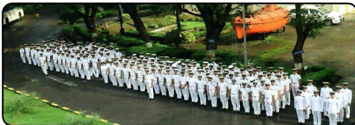
Cadet's Morning parade