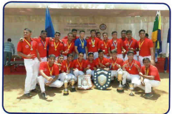
Annual Sports Day