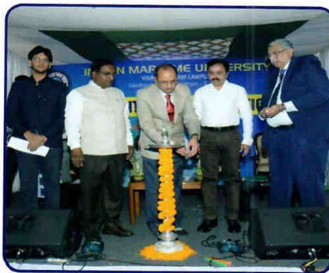
University Day Function 14.11.2018

Chief Guest: Director, Indian Institute of Petroleum Energy, Visakhapatnam