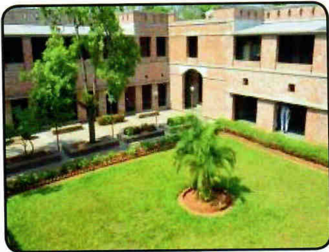
IMU Premises – View III