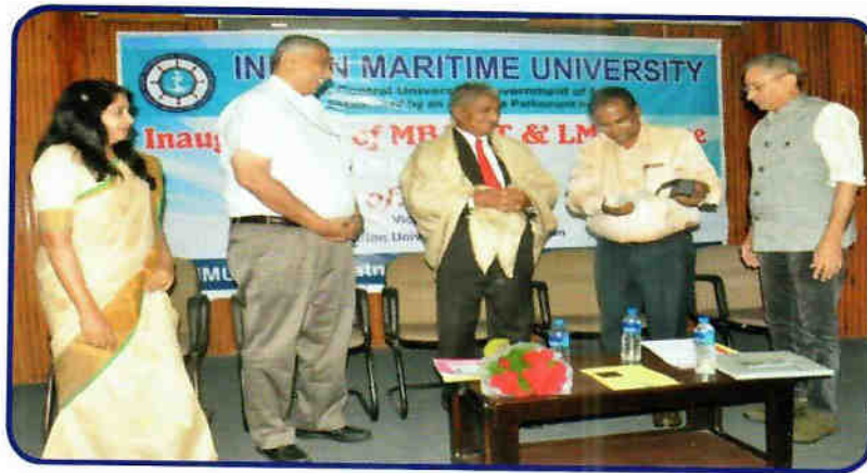
MBA Programme Inauguration 02.08.2018