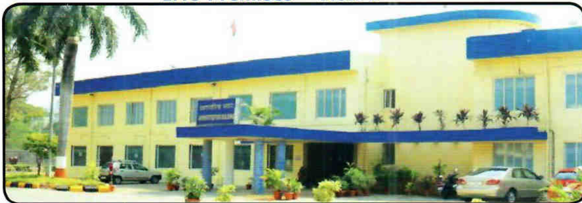
IMU Premises – View II