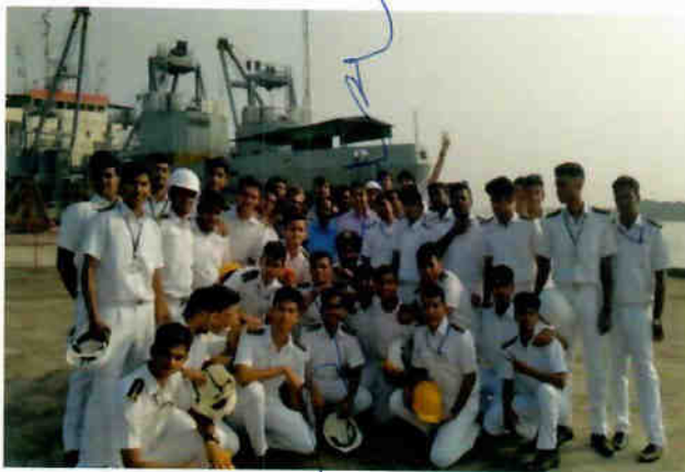
Cadets of IMU Kochi Campus