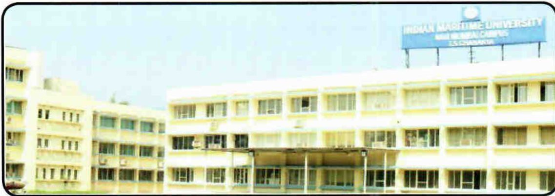
IMU Premises – View I