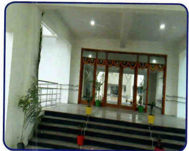
New campus of IMU Visakhapatnam