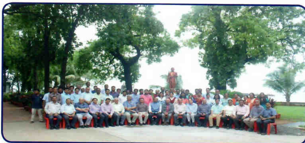
Faculty & Staff of IMU Mumbai Port Campus