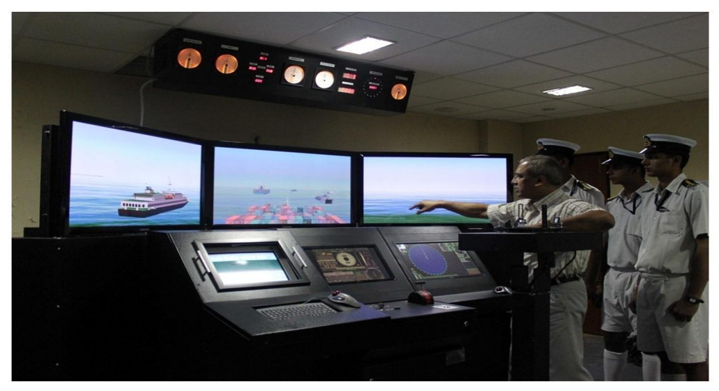
Simulator Training at T.S. Chanakya, IMU Mumbai Campus

T S Chanakya is the successor of T S Rajendra and the grand old lady of Indian Shipping, Training Ship Dufferin, where the training of Merchant Navy Officers in India started in the year 1927. Training on T S Dufferin and subsequently T S Rajendra continued till the year 1993, when it was replaced by Training Ship Chanakya. It is the first pre-sea training institution in India. Originally, it was under the Directorate General of Shipping, Mumbai in the Ministry of Shipping. T S Chanakya is a shore based Academy which conducts 3 year B Sc degree course in Nautical Science and one year DNS programme leading to B Sc degree in Nautical Science. The training programme is so designed, to